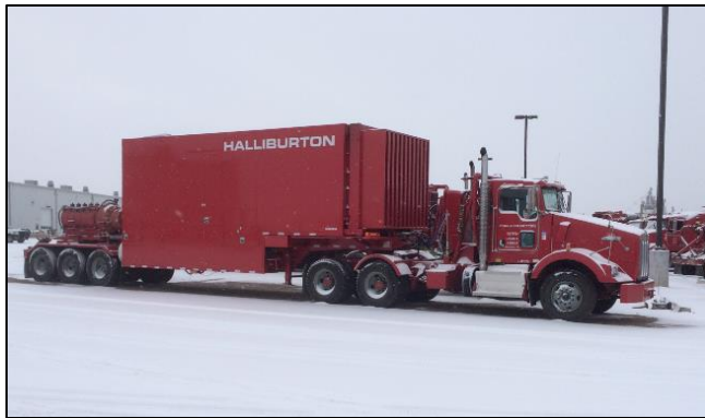
Figure 1: Halliburton's noise/emissions reducing Echo fleet